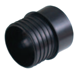
Stock number JW 1047 Machine port, \varnothing 100 mm