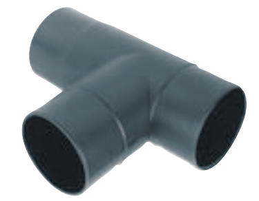
Stock number JW 1013 \cdot T-fitting, \varnothing 100 mm For use where design limitations will not allow use of a "Y"