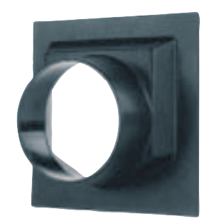
Stock number JW 1005□ 355 x 355 mmStock number JW 1001□ 210 x 210 mmStock number JW 1010□ 158 x 158 mmUniversal dust hood, Ø 100 mmSpecially designed for shop use