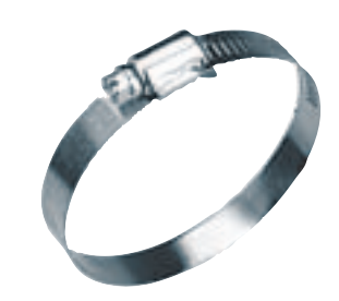
Stock number JW 1022 Galvanized hose clamp, \varnothing 100 mm Used to connect dust collection hoses