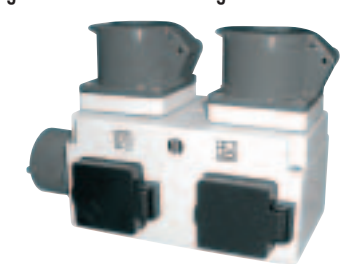
Stock number 10000340 · Automatic start